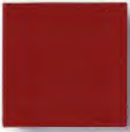
▲ Colonial Red