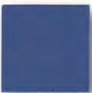
▲ Slate Blue