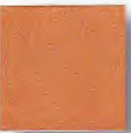
●▲ Copper Penny