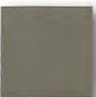
●▲ Aged Copper