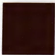
▲ Mansard Brown