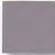
▲ Slate Gray