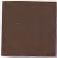
▲ Medium Bronze