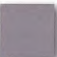
●▲ Weathered Zinc