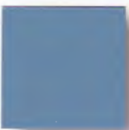
▲ Military Blue