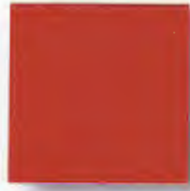
▲ Terra Cotta