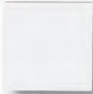
▲ Stone White

Kynar 500® or Hylar 5000® pre-finished galvanized steel and aluminum for roofing, curtainwall and storefront applications.