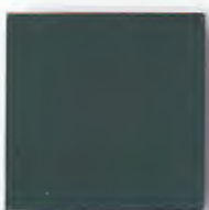
▲ Hunter Green