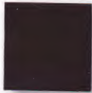
▲ Dark Bronze