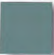
▲ Hemlock Green