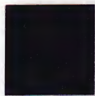
▲ Matte Black