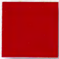
▲ Cardinal Red