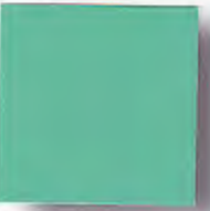
▲ Patina Green